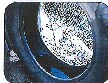
Recycle used tires or keep them protected from rain.