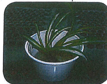
Put plants in soil, not in water.