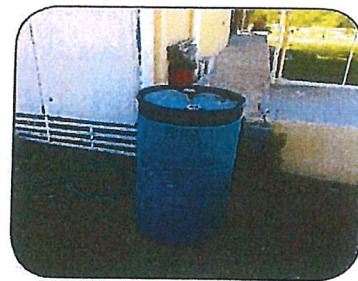
Keep rain barrels covered tightly.

* The EPA's search tool is available at: www.epa.gov/insect-repellents/find-insect-repellent-right-you