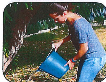
Drain & dump any standing water.