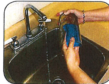
Weekly, scrub vases & containers to remove mosquito eggs.

National Center for Emerging and Zoonotic Infectious Diseases Division of Vector-Borne Diseases