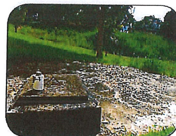
Keep septic tanks sealed.