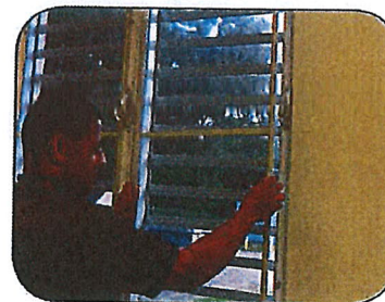
Install or repair window & door screens.