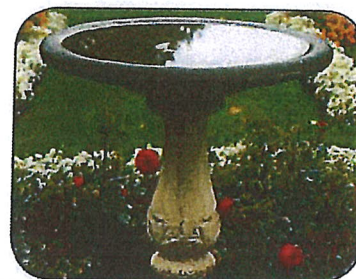
Weekly, empty standing water from fountains and bird baths.