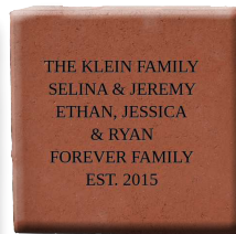
8x8 Sample Brick